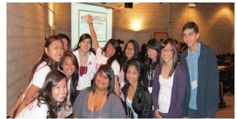
Asian Pacific American Islander Youth Leadership Symposium

For information on these programs visit www.unlv.edu .