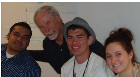
Dean's Future Scholar's Staff