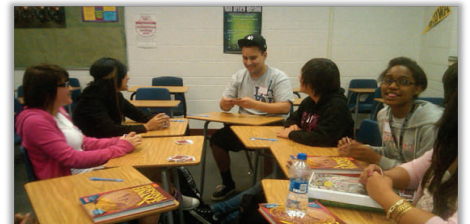
Parents and students participating in a LEADSS program