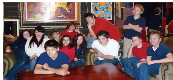
Brown Middle School students

For information on this program visit www.asaslv.org .