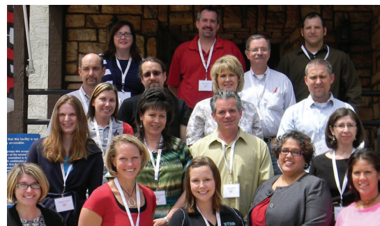
Participants of Nevada's First Navigation 101 Workshop

Access Challenge Grant, Nevada eligible high schools apply for a sub grant to implement the Navigation 101 program. For information about Navigation 101 please visit our website at http://www.nevada.edu/epscor/college-access.html